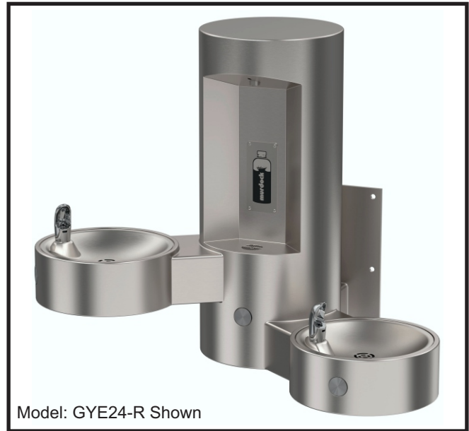
Model: GYE24-R Shown